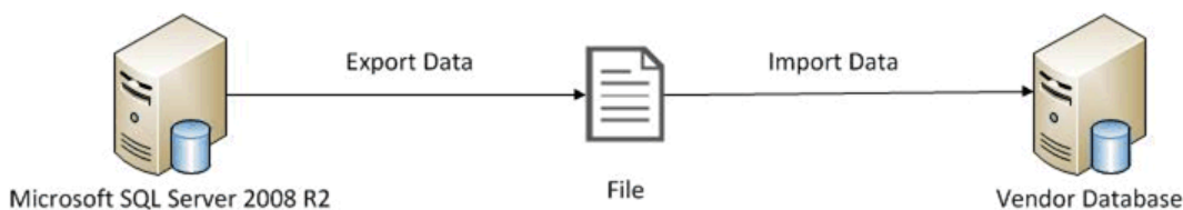
Figure 3: Import data

The data import scenario describes importing customer data from a vendor database that can produce files that contain data into Microsoft® SQL Server® 2008 R2 database. As shown in the following figure, a file containing the data can be created by using the vendor's utility and imported into Microsoft® SQL Server®. The vendor can export the data in Unicode text file format.