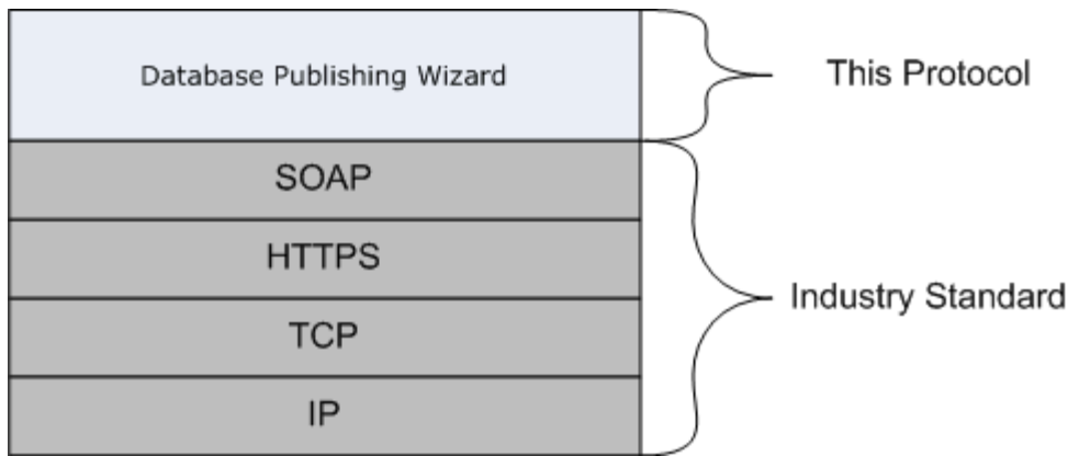
Figure 2: SOAP over HTTPS